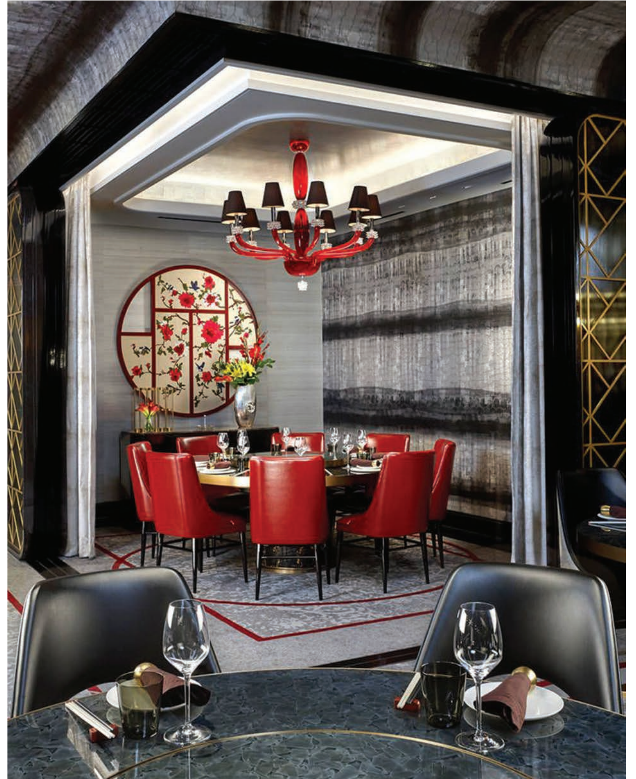
Red Plate at The Cosmopolitan, Las Vegas, NV Designer: Celano Design Studio Purchaser: The Cosmopolitan of Las Vegas Bar cabinet and wall art realized by Eric Brand