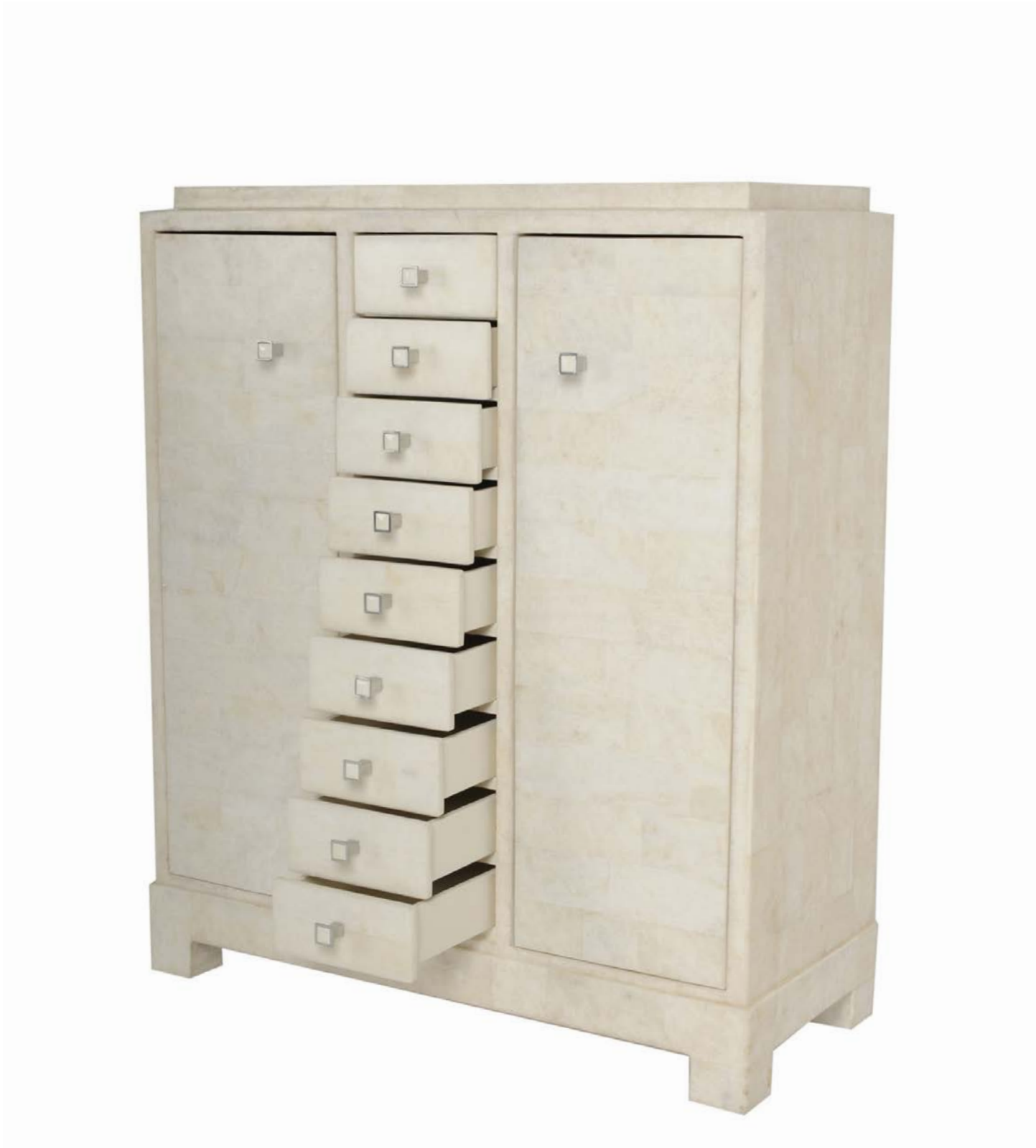
veneered crystal stone