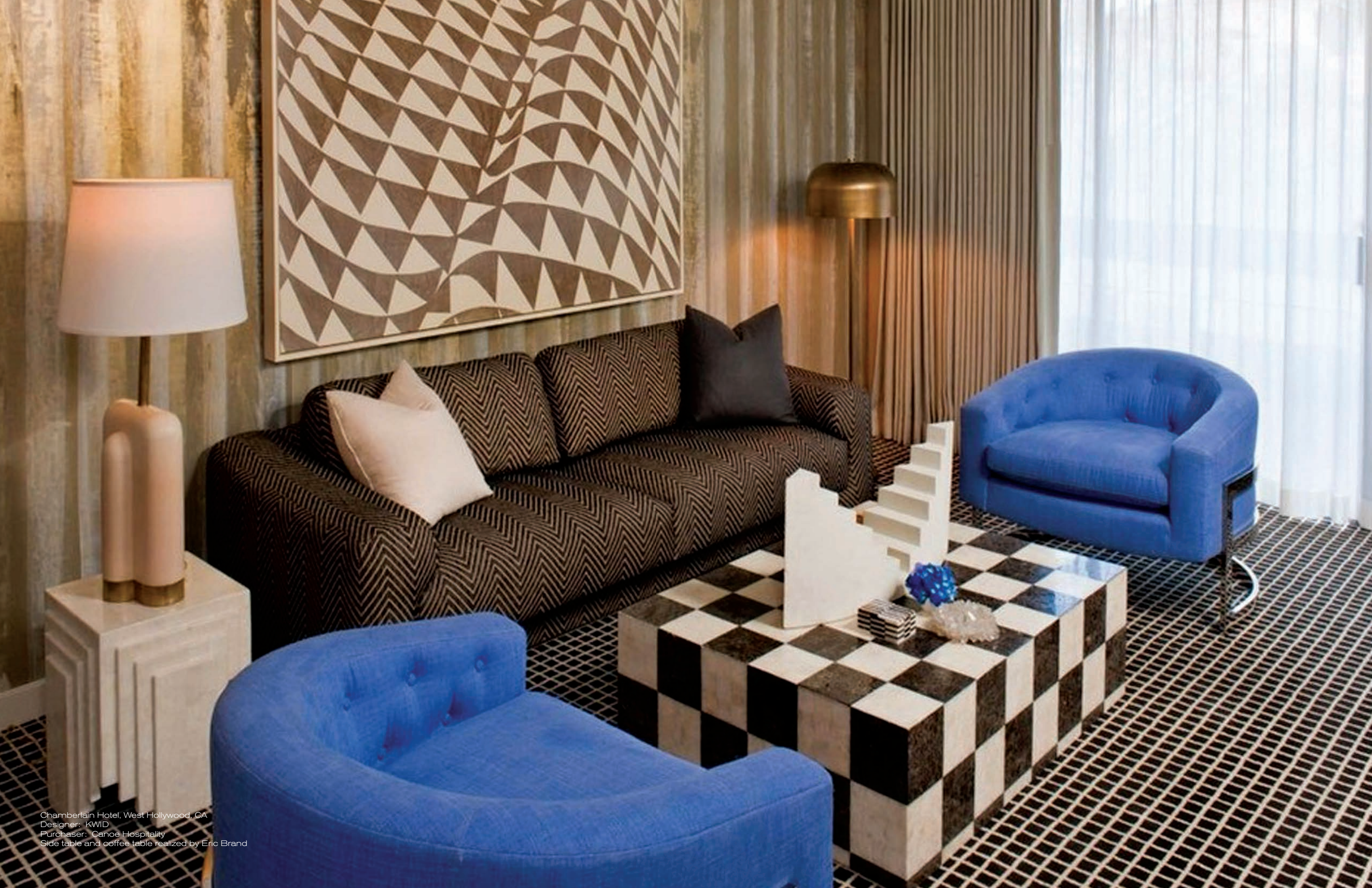
Chamberlain Hotel, West Hollywood, CA Designer: KWID Purchaser: Canoe Hospitality Side table and coffee table realized by Eric Brand