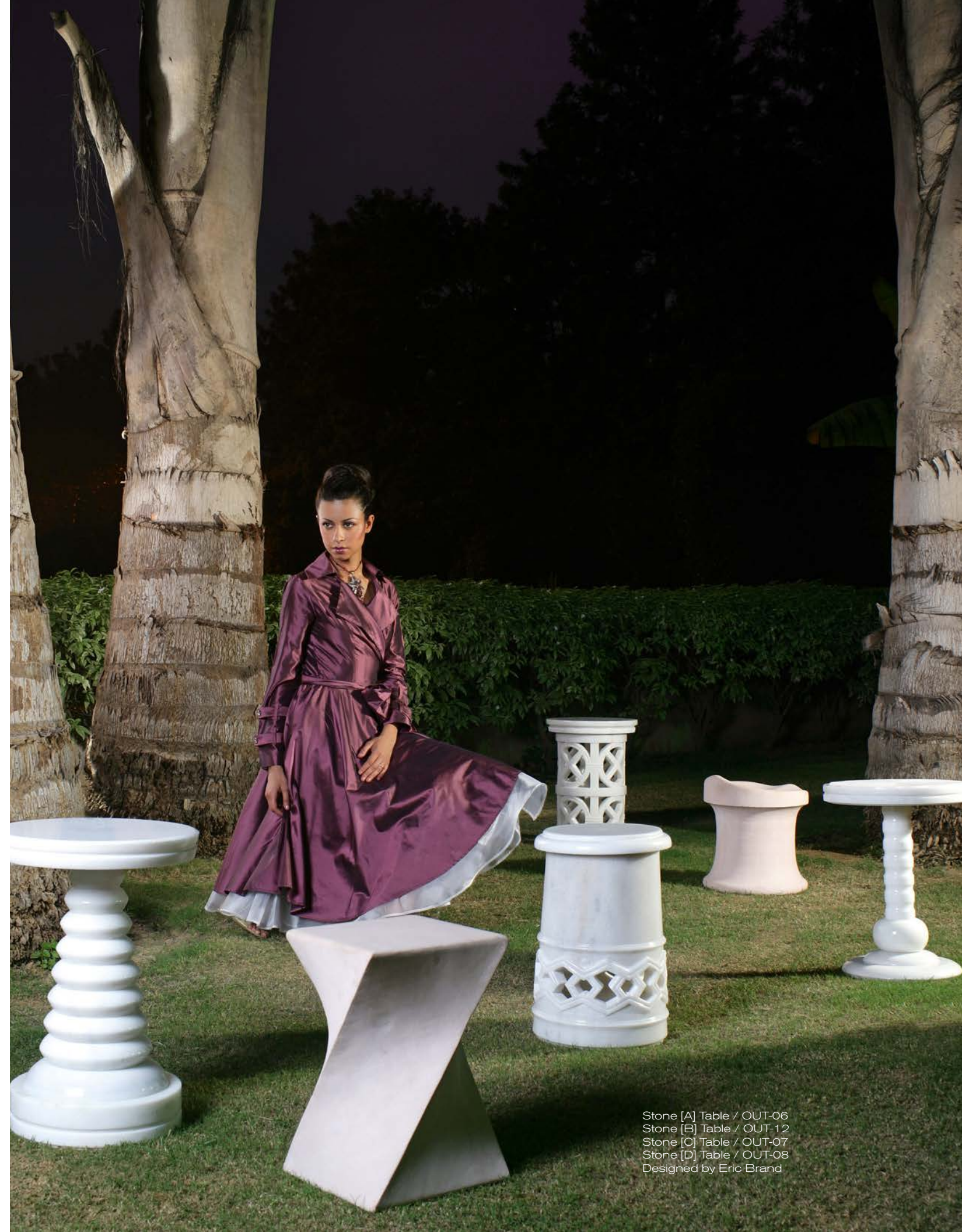
Stone [A] Table / OUT-06 Stone [B] Table / OUT-12 Stone [C] Table / OUT-07 Stone [D] Table / OUT-08 Designed by Eric Brand