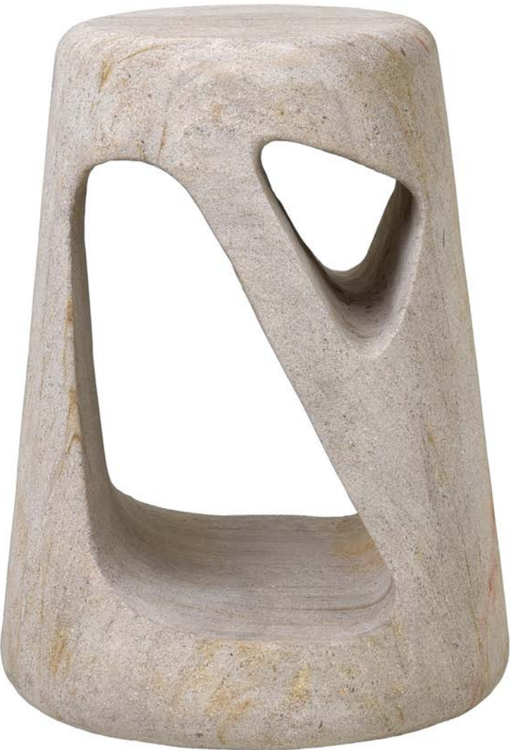
Hollow Stone Side Table / OT-120 Designed by Eric Brand