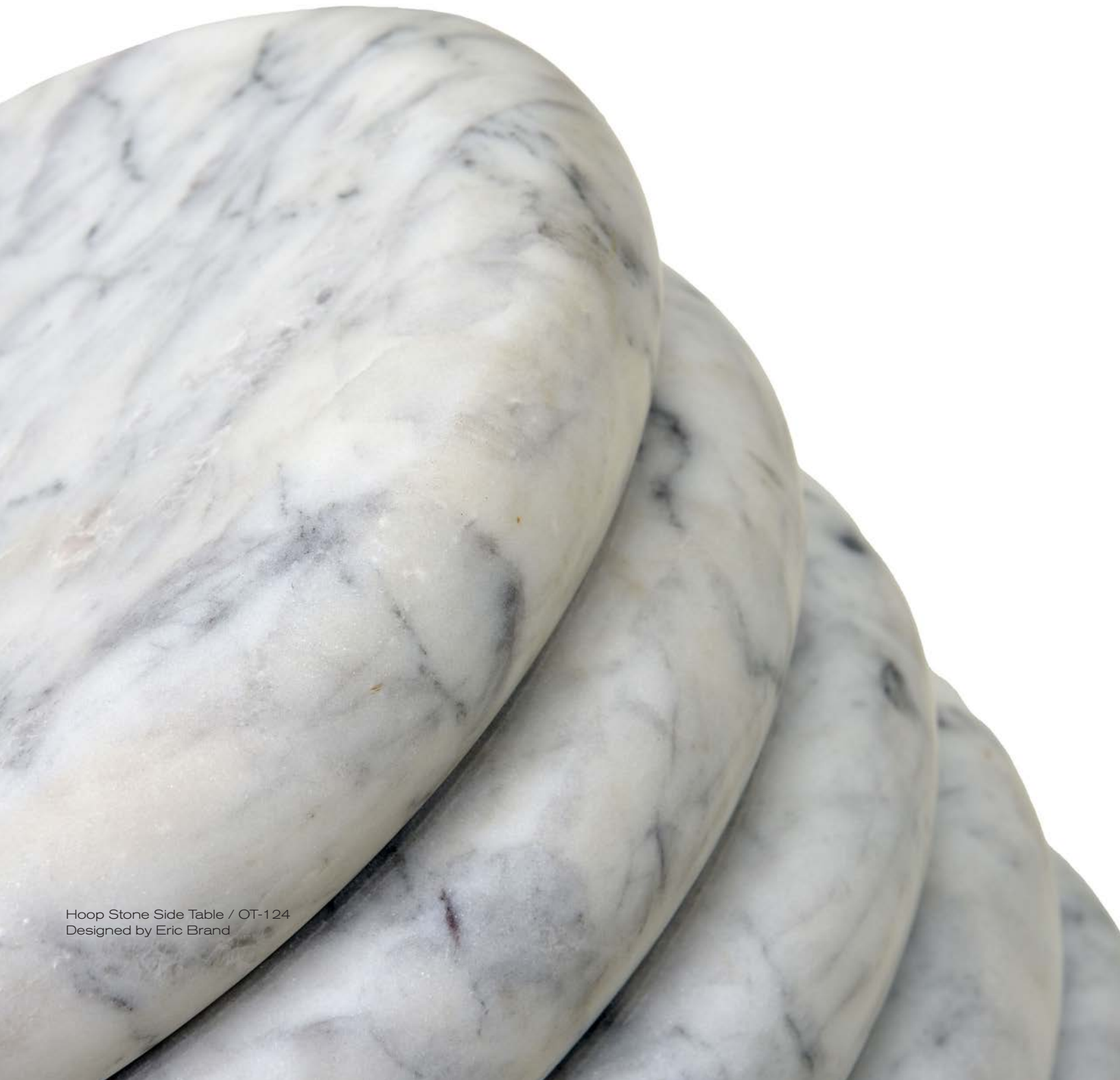
Hoop Stone Side Table / OT-124 Designed by Eric Brand