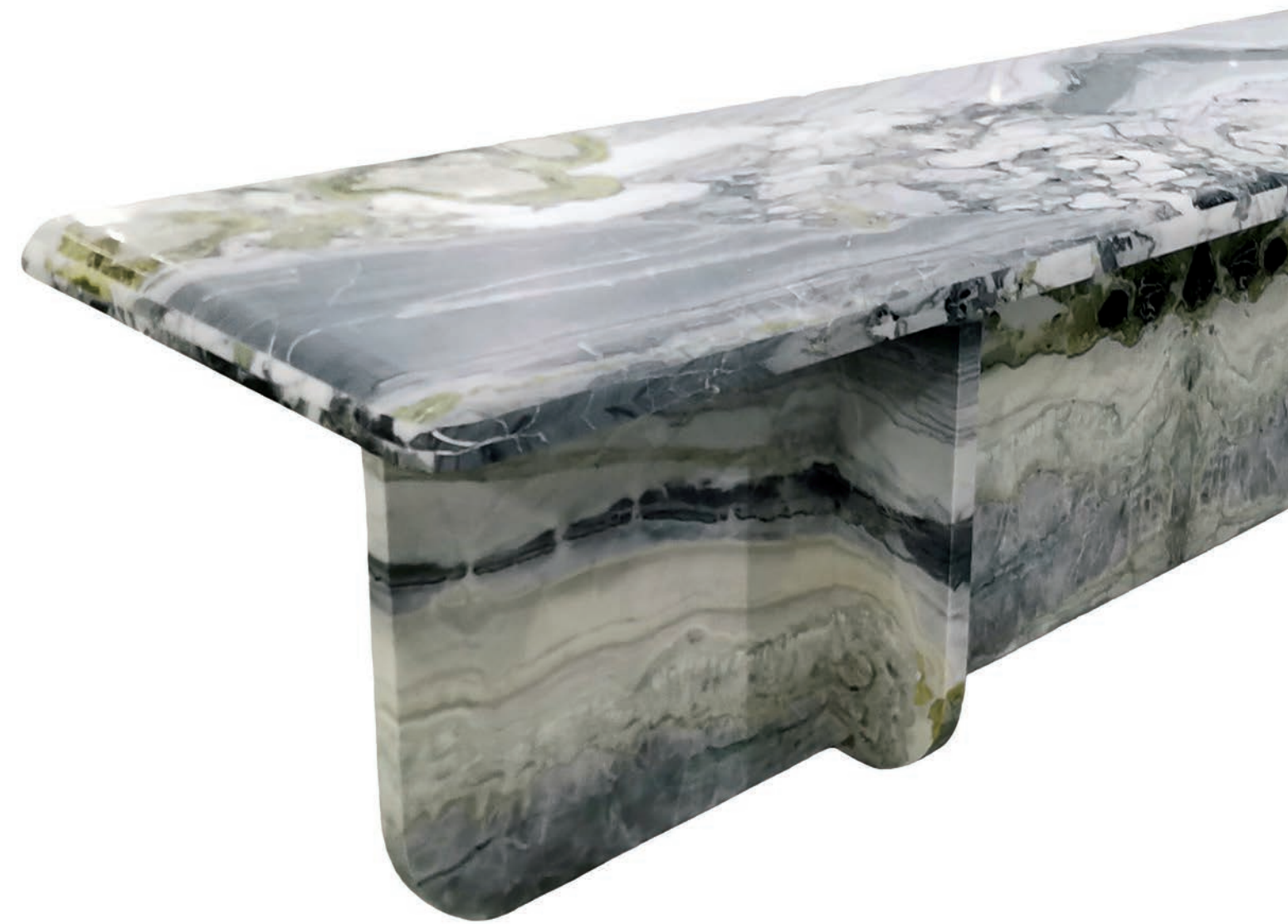
green beauty marble